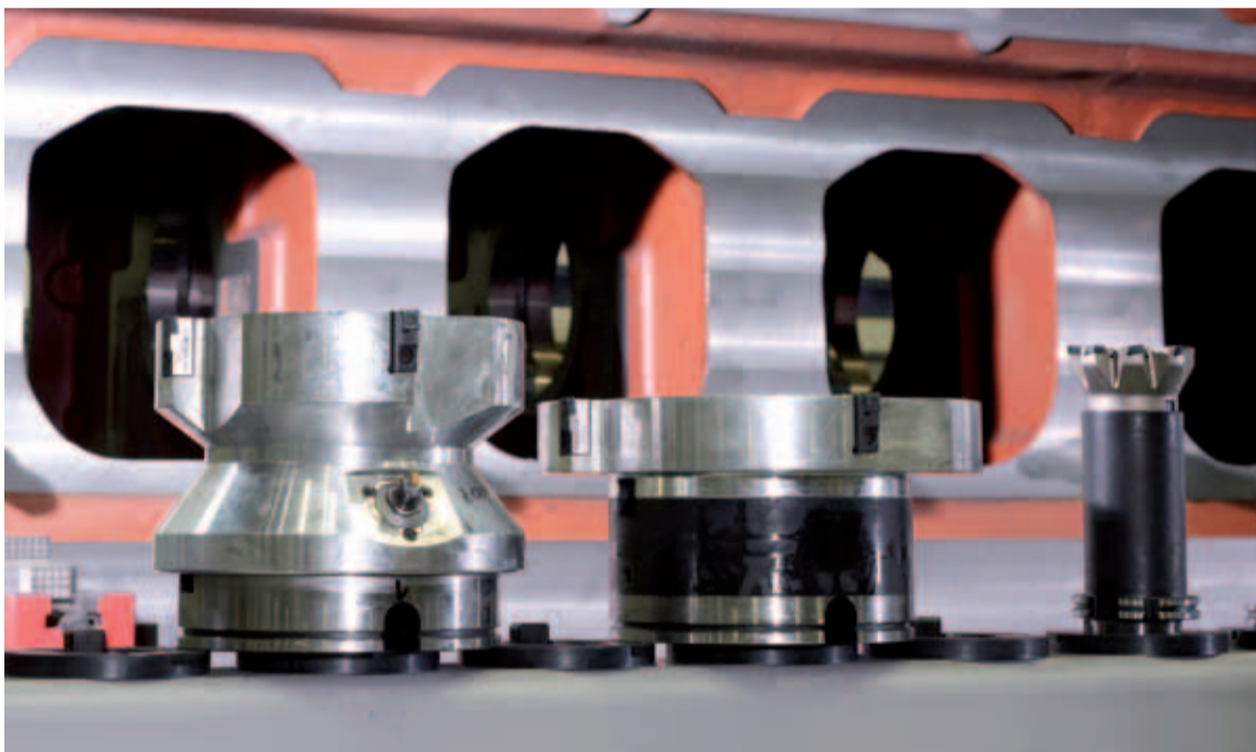
The ProfiMill for JDEC was equipped with fully automated aggregate and tool changers.

Since the machining of engine blocks often includes areas which are difficult to access, the machine was equipped with extensive special components promoting machine efficiency – eight milling heads are smoothly interchanged by fully automated aggregate changers. An automatic tool changer with space for 192 tools was also integrated.