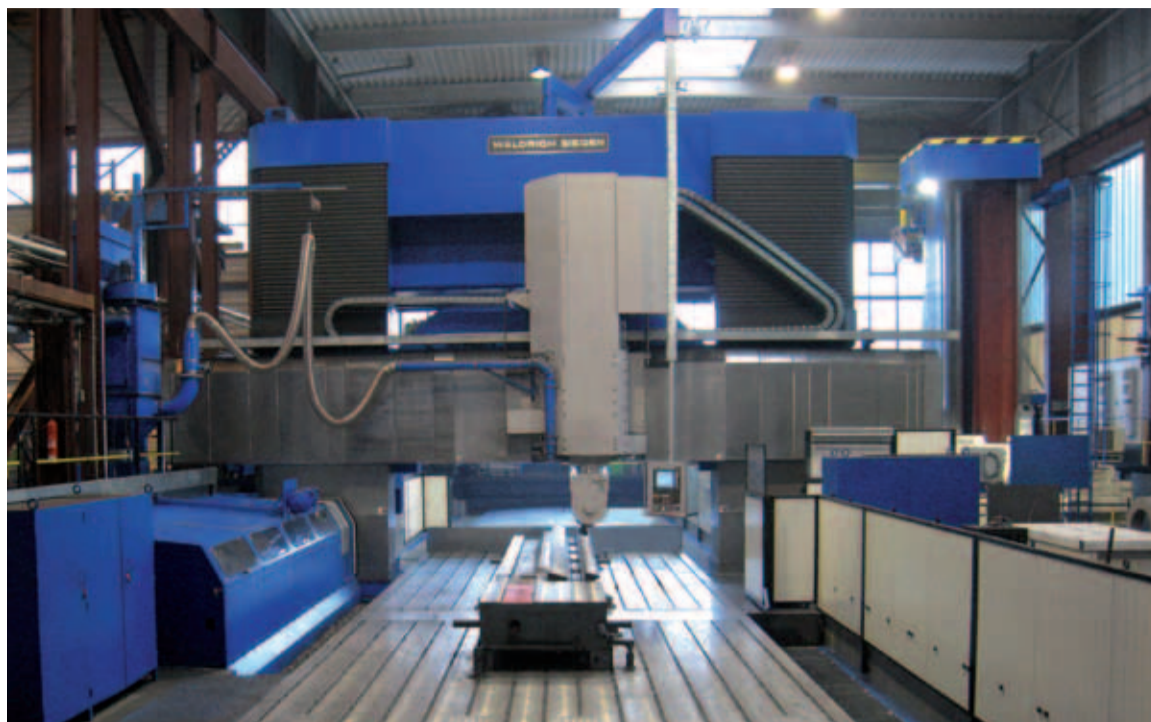
After 50 years of reliable use the portal milling machine is again one of the most powerful machines worldwide.

When WaldrichSiegen commissioned a portal milling machine at their production site in Burbach in 1962, the machine was the most modern machine of its kind in Europe. Here, the machine precisely processed components for 18 years. After relocating the production site from Siegen to Burbach (Germany), WaldrichSiegen sold the machine to contract manufacturer Jung Großmechanik GmbH & Co. KG in Bad Laasphe where the machine was used for another period of 30 years.