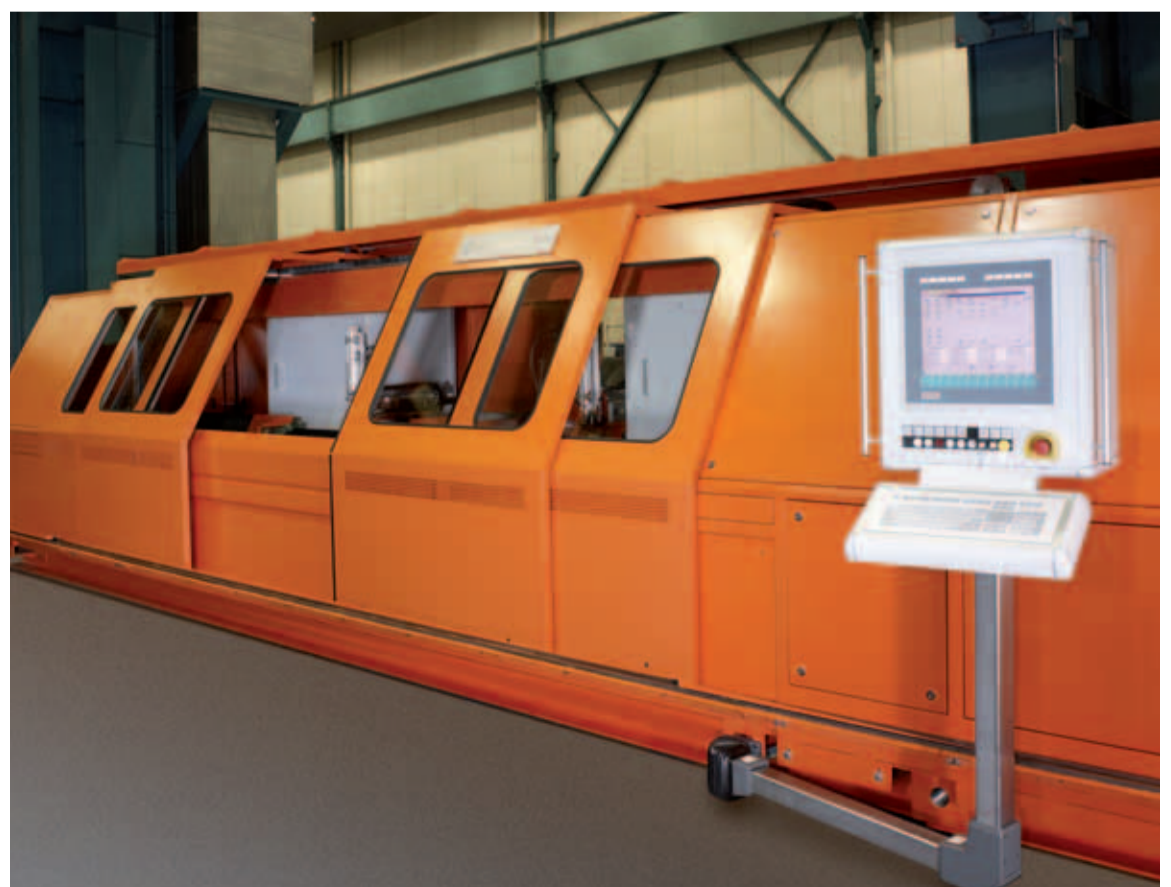
The customer is going to machine 200 rolls per months with the ProfiTex 60S.